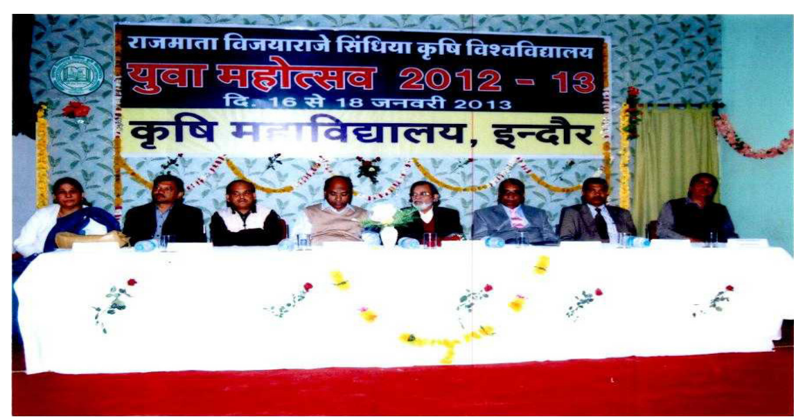
Respective delegates from various Colleges of R.V.S.K.V.V. on the opening ceremony of the youth festival