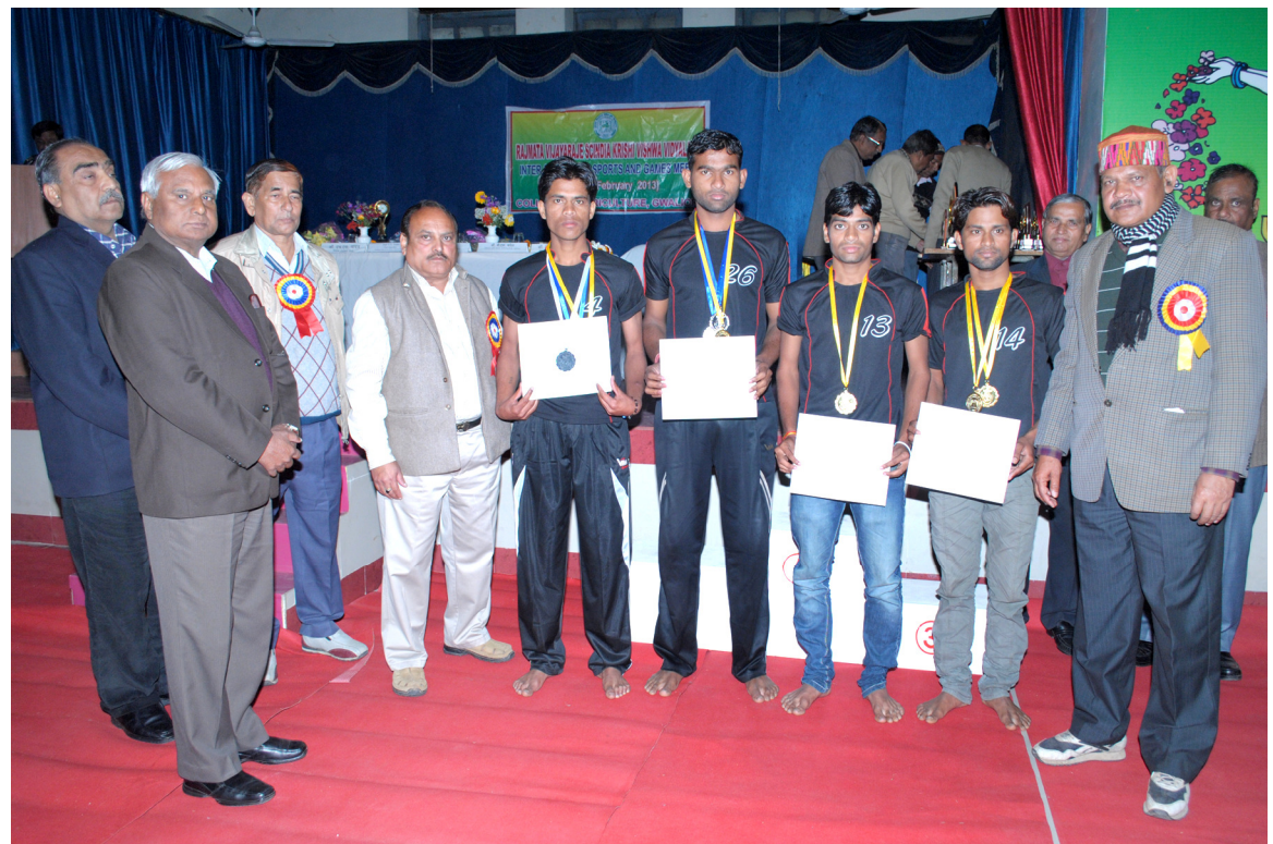
COA Khandwa received the gold medal in 4X100 m Relay Race