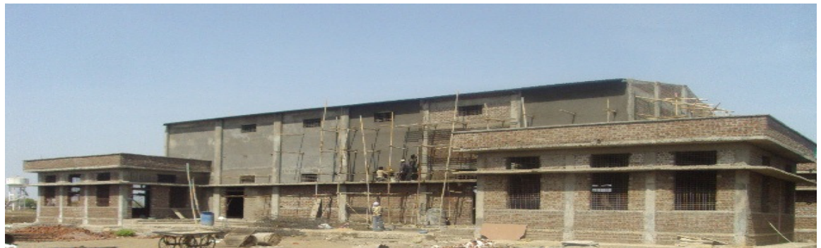
Under constriction badminton hall (exterior view)