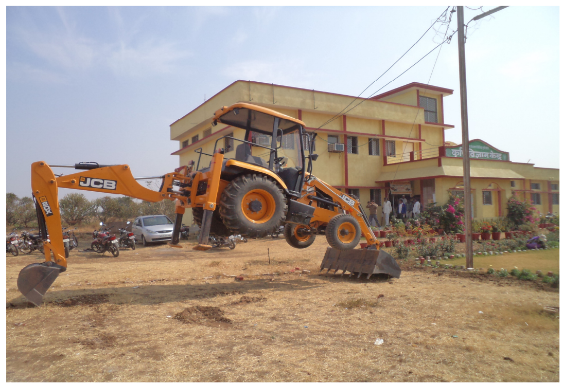
Demostration of JCB machine to the farmers at KVK Khandwa.