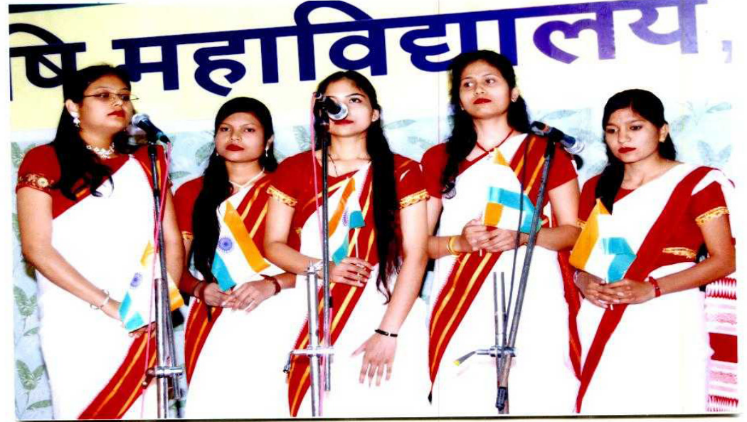
Students of COA, Khandwa performing in the singing competition.