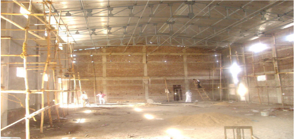
Badminton hall under construction (Interior view)