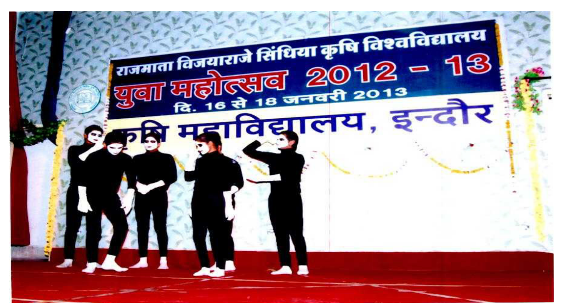
Students of COA, Khandwa performing in the mime competition.